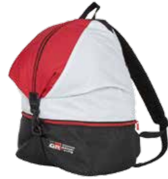
Rucksack A race-day essential, featuring removable carabiners for expanded storage capacity. Size : W310×H460×D180mm Material : 100% nylon