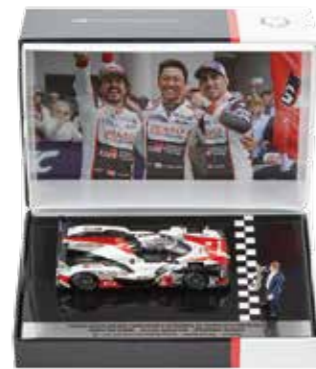
2018 TS050 HYBRID Model Car No.8 WEC Le Mans 24 Hours Victory Commemorative Package (1/43 scale) 1/43 scale replica of winning car No.8. Limited to 4,000 models worldwide, the replica comes in a specially designed case with a serial number plaque affixed. Size : 1/43 scale Material : Resin