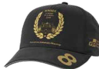
2018 WEC Le Mans 24 Hours Victory Commemorative Cap Features a motif of winning car No.8, with embroidered driver name and race logo. Size : One size Material : 100% polyester