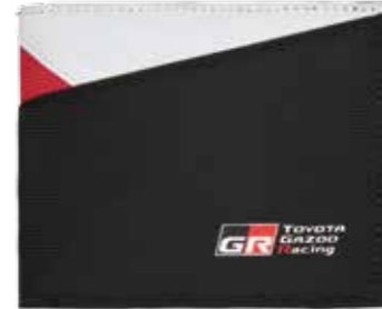
Wallet Water/scratch/dirt resistant, easy-to-use two-way folding sports wallet. Size : [Closed] W115 × H95mm [Opened] W225 × H95mm Material : 100% nylon