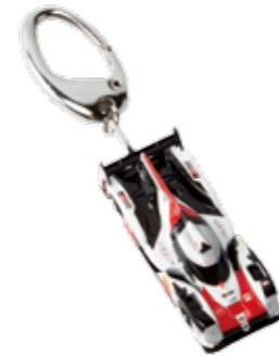
TS050 HYBRID Car Keyring This imposing keyring is inspired by the TS050 HYBRID. Size : L55 × W22 × H12mm Material : Diecast