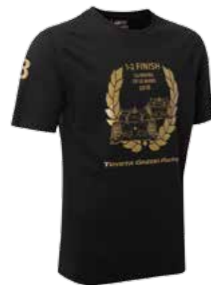
2018 WEC Le Mans 24 Hours Victory Commemorative T-shirt Features a motif of cars No.7 and No.8 that claimed a 1-2 victory at Le Mans. Also features sleeves embroidered with the cars' numbers. Size : S-XL Material : 100% cotton