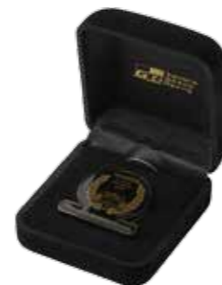
2018 WEC Le Mans 24 Hours Victory Commemorative Pin Badge Comes in a gift box and features a motif of winning car No.8.