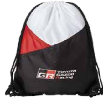
Pullbag A must-have for race days that doubles as a gym bag or shoe bag. Size : W380 × H450mm Material : 100% polyester