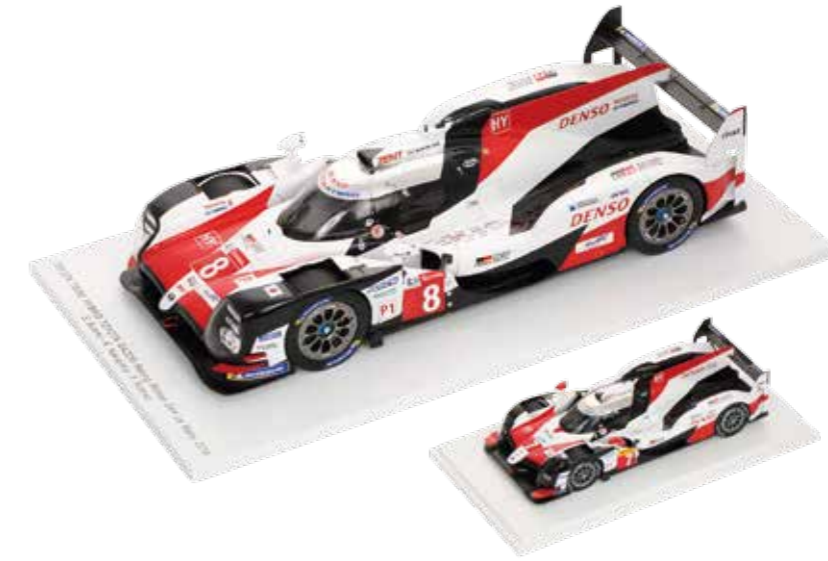
2018 WEC Le Mans TS050 HYBRID Model Car No.8 (1/18 scale) This 1/18 scale replica of the TS050 HYBRID Car No.8 that won the 2018 24 Hours of Le Mans makes for a great collector's item. Size : 1/18 scale Material : Resin