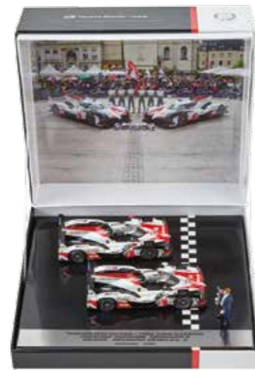
2018 TS050 HYBRID Model Cars No.7, No.8 WEC Le Mans 24 Hours Victory Commemorative Package (1/43 scale) 1/43 scale replica set of winning cars No.7 and No.8. Limited to 1,500 sets worldwide, the set features two replicas that come in a specially designed case with a serial number plaque affixed. Size : 1/43 scale Material : Resin